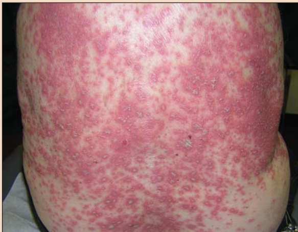
FIGURE 2. Pustular psoriasis.