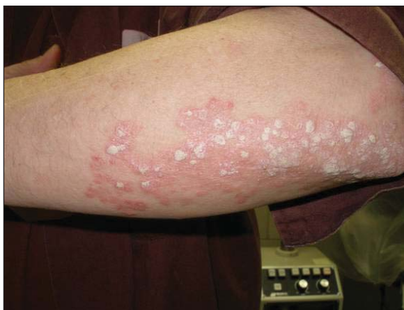
FIGURE 1. Plaque psoriasis.

The advent of biologic therapy has greatly changed the course of psoriasis treatment. A more detailed discussion on conventional (“prebiologic”) therapies for