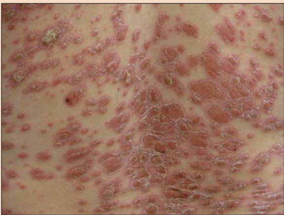
FIGURE 3. Pustular psoriasis.