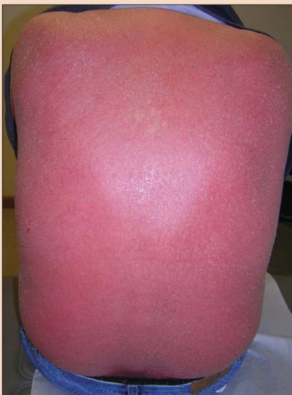
FIGURE 4. Erythrodermic psoriasis.

Paradoxically, use of anti-TNF agents may infrequently flare psoriasis; this patient's erythroderma was temporally related to initiation of adalimumab therapy. Adalimumab use was discontinued, and improvement was noted following a short course of oral systemic steroids. To date, the patient's psoriasis has been most difficult to control.